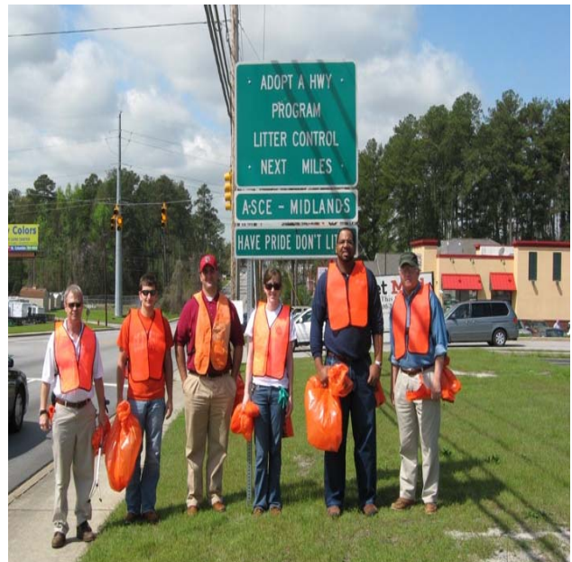
Adopt-A-Highway Pickup on April 3 rd